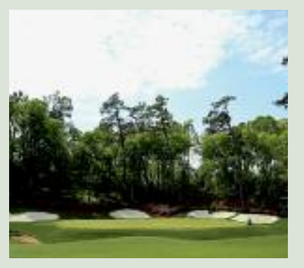
10th & 11th holes: The 10th and 11th holes at Cavendish, considered by Tom Doak to be two of the best par 4s in golf, play alongside the River Wye, which meanders as it flows across the approaches of both holes. Through Amen Corner, Rae's Creek does exactly the same thing.