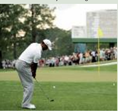
7th hole: The 'bump and run' shot was encouraged on holes 1, 3, 5, 6, 7, 14 and 17 at Augusta from the outset and this is the case on Cavendish's 7th, with a raised green and a sloping approach that must be skilfully played to gain the best advantage.