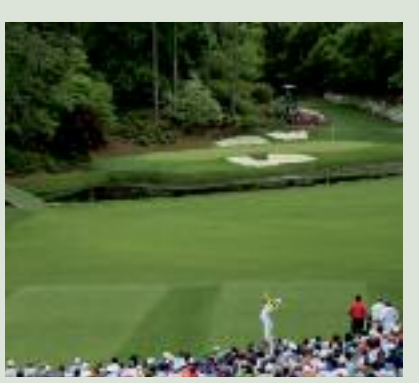
4th hole: There are elevated tee-shots on both the 4th and 9th holes at Cavendish – par 3s playing over deep valleys, like 4,6 and 12 at Augusta. The effect of the trees at Cavendish causes eddies and swirls that can make a two or three-club difference – just like Augusta.